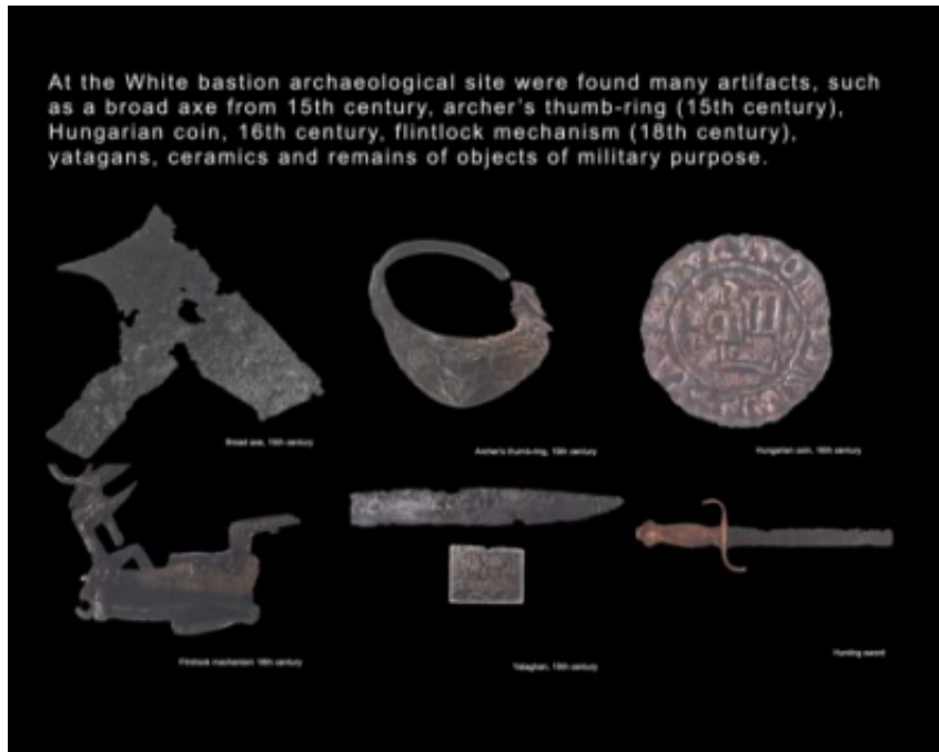
Figure 3. Artefacts found on the site

We believe that the use of different modern surveying technologies will provide us more information about early stage of fortification. Using 3D-visualization we will be able to follow the “growth” of the fortification through history. Creating a 3D model where different historical stages of the object are overlapping, will fill the gaps in our understanding of the object’s history. Using remote sensing techniques, we will improve our excavation data and obtain a new direction in excavation process that will come in the future. Creating virtual reconstruction accompanied with 3D models of the artefacts that are found and interactive digital storytelling about the use of the fortification will bring closer heritage to habitant and to the next generations.