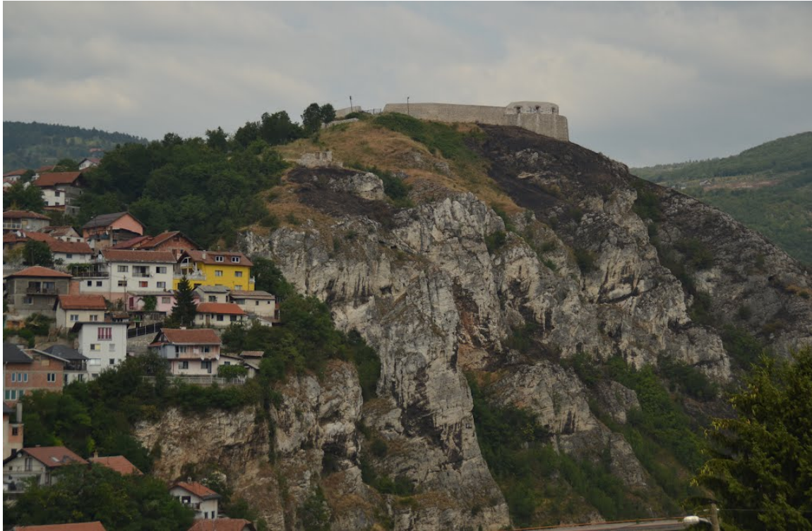
Figure 1. Bijela tabija (White bastion) fortress, Sarajevo, Bosnia and Herzegovina

The value of the historical site presents the various strata, starting from medieval until the present time. During the archaeological excavations there were found the remains from medieval fortification from 14th century, Ottomans period (17th century) when the fortification was expanded and some new objects were built. During Austro-Hungarian rule the part of the fortification and the object inside the walls were demolished and destroyed and a new group of objects was built. During the early excavation (Figure 2), a significant number of artefacts was found (Figure 3), registered and conserved for the purpose of the exhibition hosted in Museum of Sarajevo.