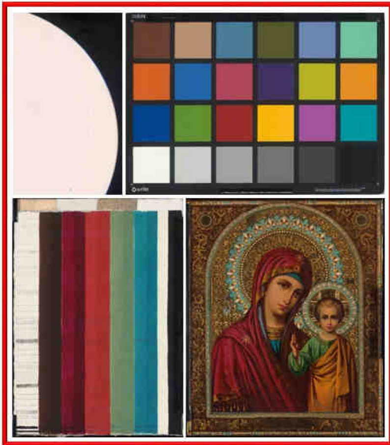
Round Robin Test spectral imaging systems