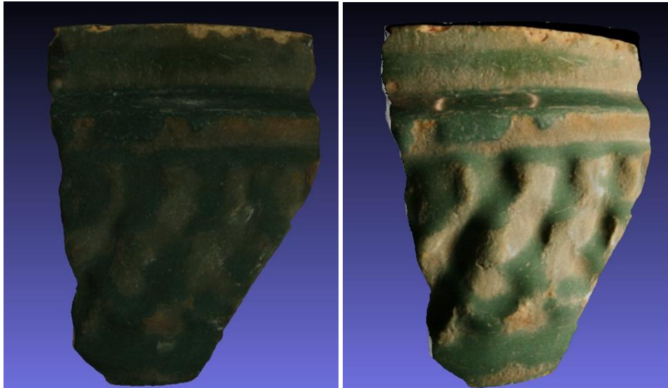
Fig. 1: Original and fused 3D textured meshes

Our final results show good potential in our method, it could be a future alternative in cases where the use of markers is not possible, but enough detail can be observed on the surface of the object/artifact. Mainly we can think of man-made objects, with strong paint, colors, strong edges, well visible surfaces with clear edges or maybe bigger structures like walls as well.