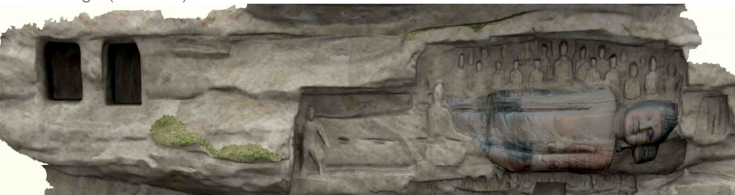
Image of a 3D record of the sleeping Buddha of Wofoyuan, China

COSCH stimulates collaborative research, establishes good practice and simplified uses of high-resolution optical techniques. COSCH research is undertaken by 5 working groups (WG):