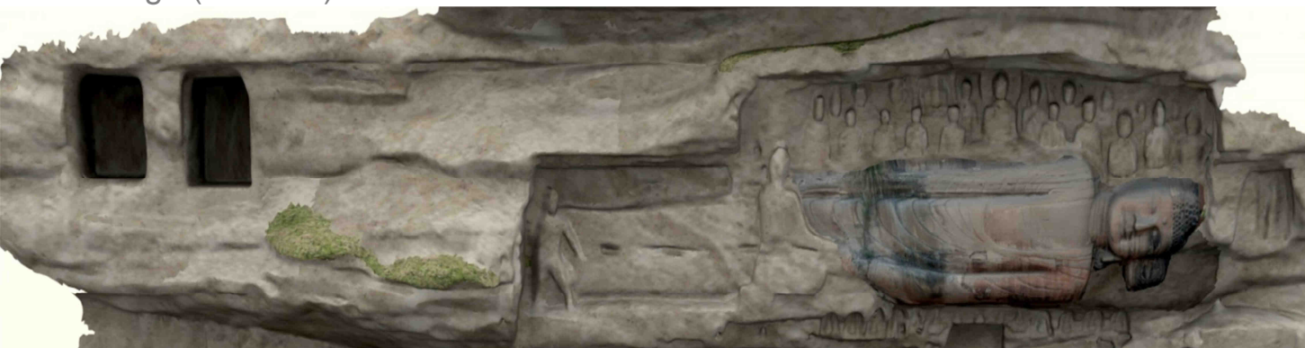
Image of a 3D record of the sleeping Buddha of Wofoyuan, China

COSCH stimulates collaborative research, establishes good practice and simplified uses of high-resolution optical techniques. COSCH research is undertaken by 5 working groups (WG):