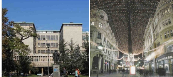
Faculty of Mathematics Mathematical Institute

Registration and information to access the meeting rooms are available in the main entrance of the Faculty of Mathematics.