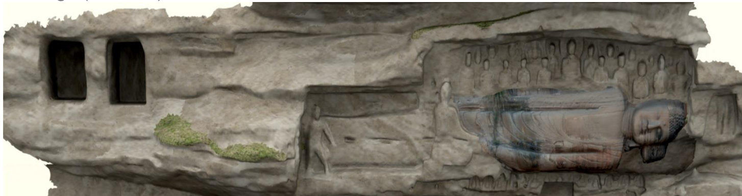
Image of a 3D record of the sleeping Buddha of Wofoyuan, China

After four years of an intensive multidisciplinary and multinational dialogue COST Action TD1201 COSCH concludes its activities through this final conference and presents the outcomes of its work devoted to the application of imaging techniques in the field of cultural heritage to the audience of scientists, educators, industry, and end users.